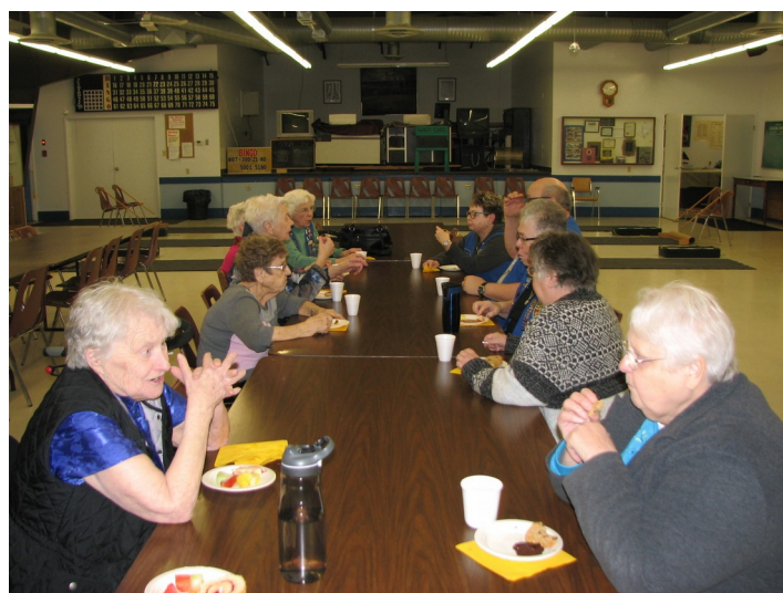
Members and Guests at the buffet table.