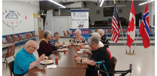
Members and Guests Dining