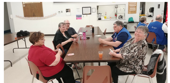
Members & Guests Playing Cards