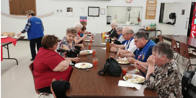
Members and Guests Dining