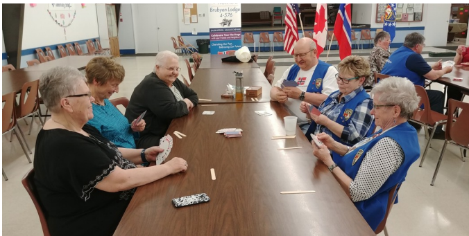
Members & Guests Playing Cards