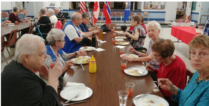
Members and Guests Dining