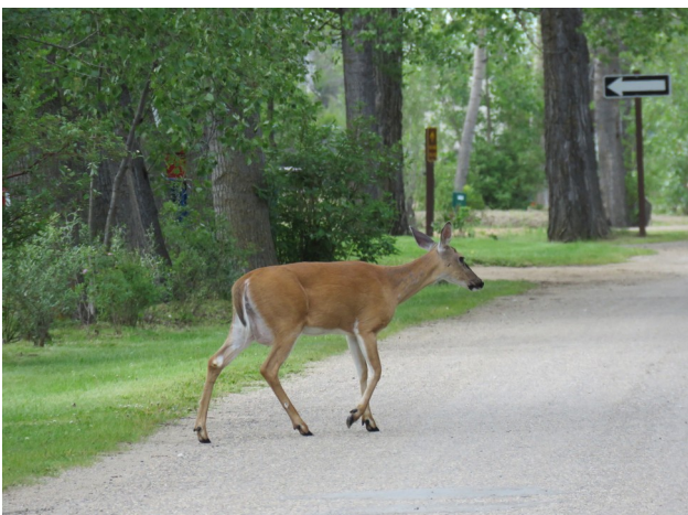
Can I play too?