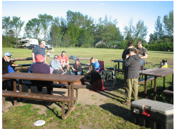
At the camp fire