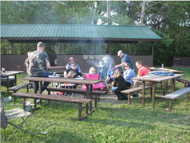
At the camp fire