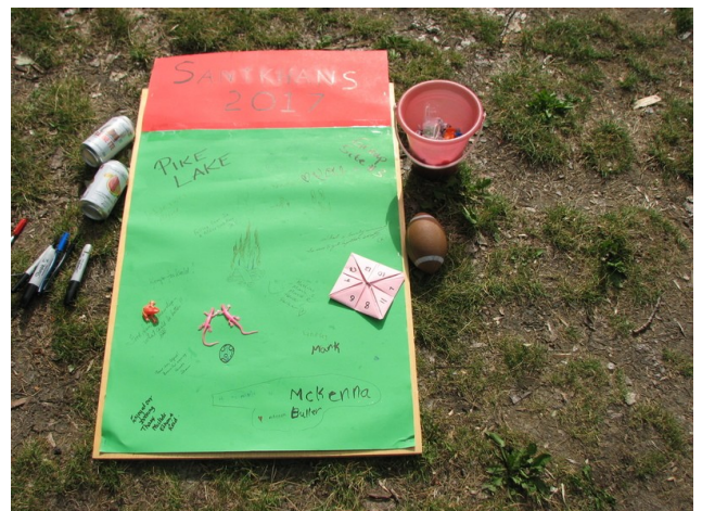
Can't wait until next year!