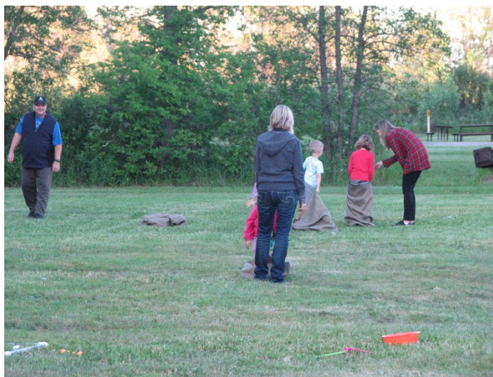
Sankt Hans 2017