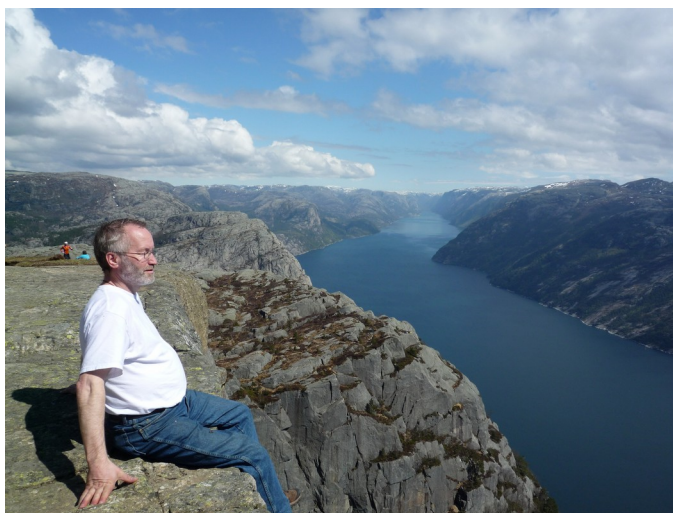
Preikestolen May 2010