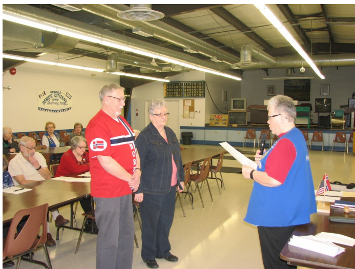
New Members Join Brubyen Lodge