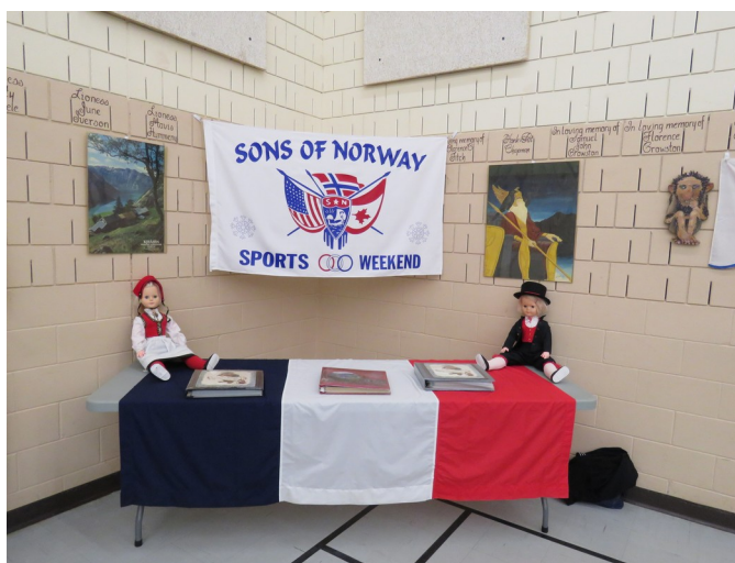
Sports Weekend 2019