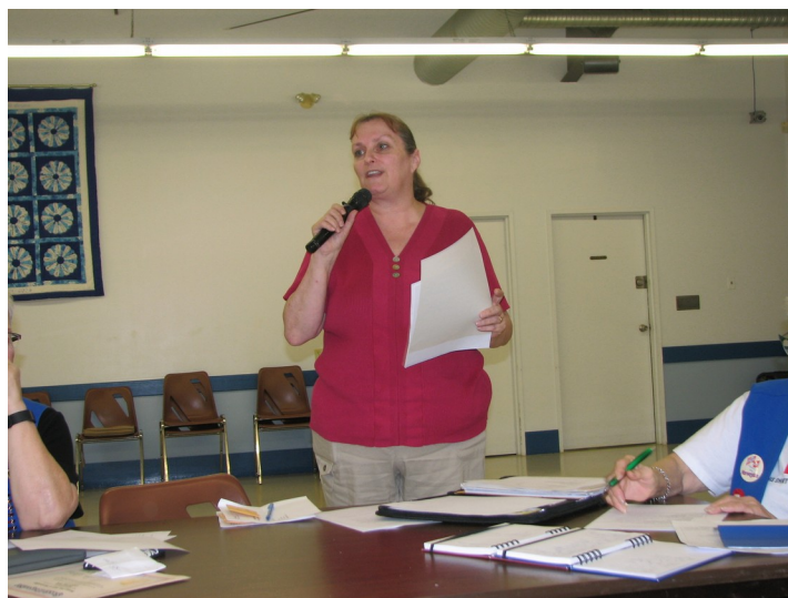
Special Birthdays, etc.