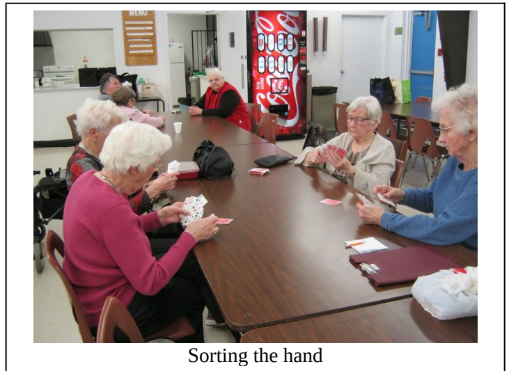
Sorting the hand