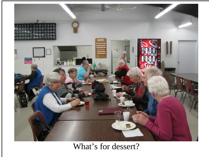
What's for dessert?